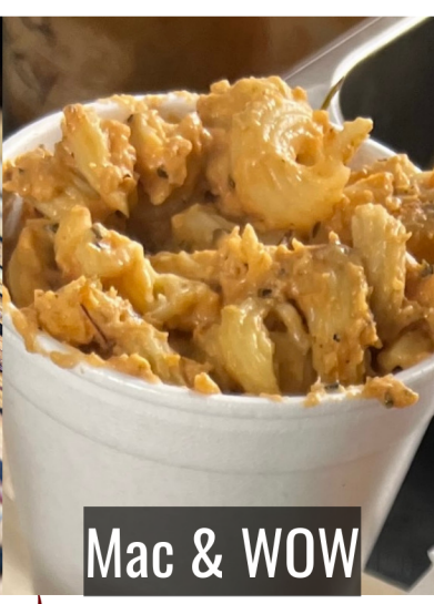
Mac & WOW